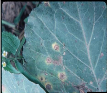
Alternaria brassiciola insectimages.org

Alternaria leaf spot Alternaria leaf spot is a fungal disease caused by at least three different species of Alternaria . Dark brown to black leaf spots appear on plants of any age and can range from a pinpoint to 2 inches in diameter. The lesions often have a concentric circle or bull's eye appearance. Spores of the fungus form within the leaf spots and can, if disturbed, be spread by wind, hands, insects, animals and tools. Dispersal of spores typically occurs during warm dry conditions, and infection occurs when leaf surfaces remain wet for 9+ hours. Spore spread of up to a mile via wind have been reported. On seeds, spores may adhere on seed surfaces and stay viable for up to 3 years, or for up to 12 years if the seed is internally contaminated.