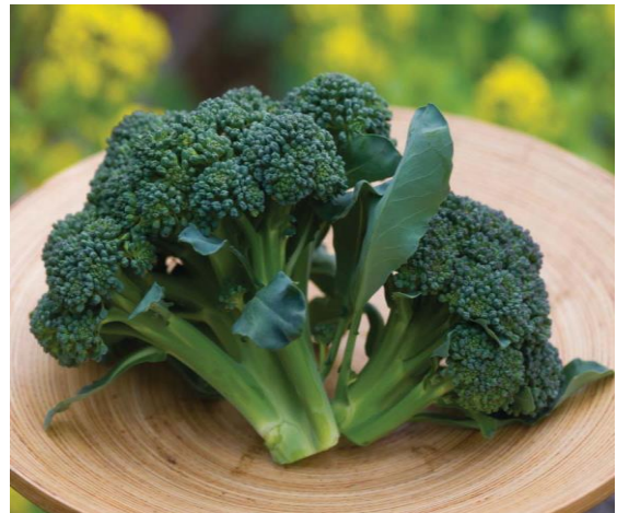
1ngb.org Broccoli var.SunKing

Brassicas are a group of popular vegetables including bok (pak) choy, broccoli, Brussels sprouts, cabbage, cauliflower, collard, kale, kohlrabi, rutabaga and turnip. Chinese cabbage, brown mustard, rape and radishes are also members of the B. oleracea family. Commonly called “cole” crops because of the stems and stalks associated with members of this family, brassicas can be found in products from condiments to salad greens. They are cool weather (60-65°F) plants that do not tolerate high temperatures. All have similar growing requirements, insect pests and diseases. Nutritionally they provide Vitamins A, C, folate, and the minerals calcium, potassium, and iron. They are also a source of fiber.