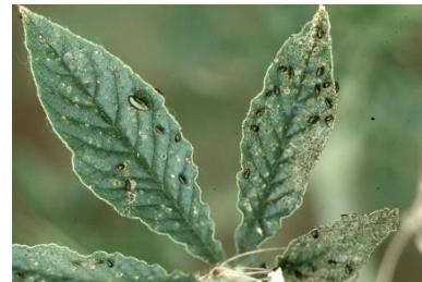
adult beetles