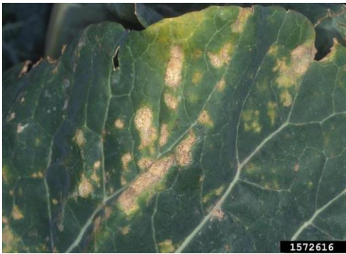
Downy mildew on brassica

Downy mildew is a disease caused by a fungal-like organism. Small, angular lesions develop on leaves and flowers. As lesions enlarge, they turn yellow-orange in patches on the upper leaf surface with a greyish powder on the undersides. Heavily infected areas turn gray-purple, and take on a fuzzy, downy appearance. The leaf may look papery as well. The pathogen is spread by wind and water. Infection occurs in wet, cool weather. Downy mildew is most important on brassica seedlings but can occur on older plants as well. The disease stresses plants and may make them susceptible to other diseases. Continuous days of cool day and night temperatures provide conditions for disease development.