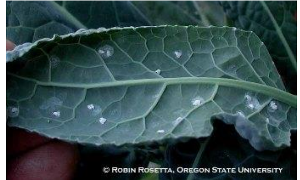
Cabbage whitefly infestation on kale

A pest of brassicas, especially kale and Brussel's sprouts, it has been an emerging problem in northeast gardens since they were first recognized in 1993. They feed by piercing the leaf then sucking out the cell contents. This causes stippling of leaves, yellowing, drying and distortion. Heavy feeding causes premature leaf drop. Heavy feeding may wilt and stunt plants. Leaf drop can result if large groups become established on a plant. Similar to greenhouse and sweet potato whiteflies, this cabbage variety can be identified by two gray blotches on each white forewing. They are not known to be a vector of plant disease but their waxy deposits and sooty mold from honeydew production reduce plant vigor and give them an unpalatable appearance.