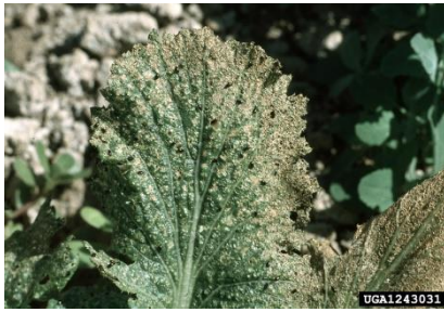
crucifer flea beetle damage

Two types of flea beetles cause damage to brassicas: the crucifer flea beetle ( Phyllotreta cruciferae ) and the striped flea beetle ( P. striolata ). The crucifer flea beetle is about 1-1/4 inch long and is shiny black. The striped flea beetle is about 1-1.5- 2 inches long, is black and has 2 yellow stripes on its back. Records in New England show that populations of both species of flea beetles have increased in the past 25 years making them a leading pest of brassicas. Adult feeding is mostly limited to stems and leaves producing small round “shot” holes. Feeding on mature waxy leaved plants is usually limited to leaf margins. Damage is more