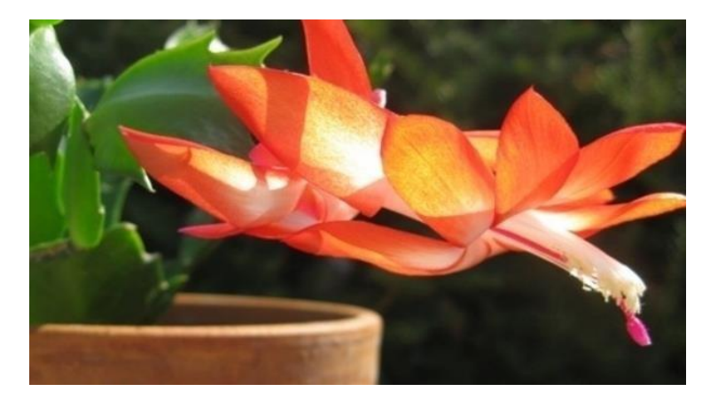
S. bridgesii, Christmas Cactus

Most holiday cacti will appreciate being set outside in a shady place during the summer months. When the temperatures drop below 50° F, it is time to bring them back inside and discontinue fertilizing. For flower buds to form, plants need to be exposed to 4 to 5 weeks of total darkness for 12 to 14 hours a day or nighttime temperatures around 55° F. Short day treatments can be administered to Thanksgiving cacti starting September 1st, Christmas cacti around October 1st and Easter cacti beginning January 1st. Alternatively, plants can be placed in an area with 60 to 70° F days and 55 to 60° F nights. After 4 to 8 weeks, flower buds will appear. Plants exposed to short day treatments may then be brought back into normal light.